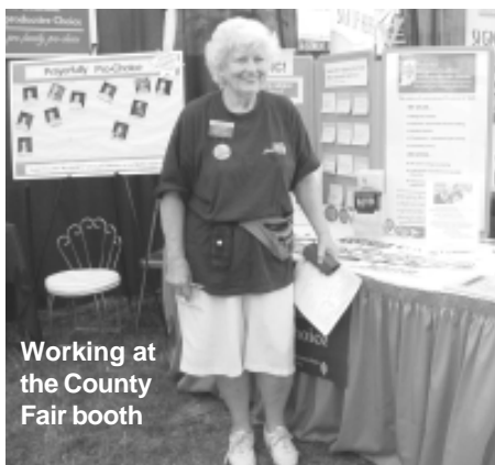
Working at the County Fair booth

One lady asked, “are you pro-abortion?” We explained that IRCRC